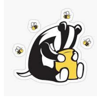
The Hungry Badger